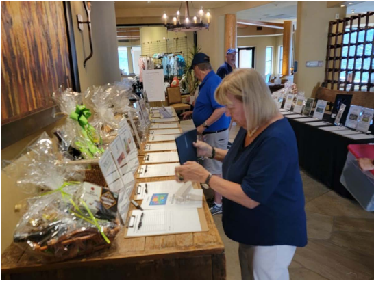
Raising a little money for our Foundation!