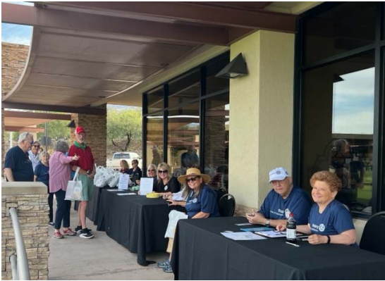
Lots to do and fun to have!