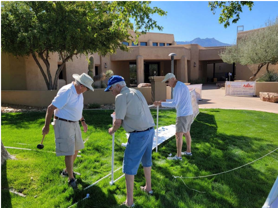
All in Volunteers!

Members' Registration for Post Tournament Dinner and Awards Presentation